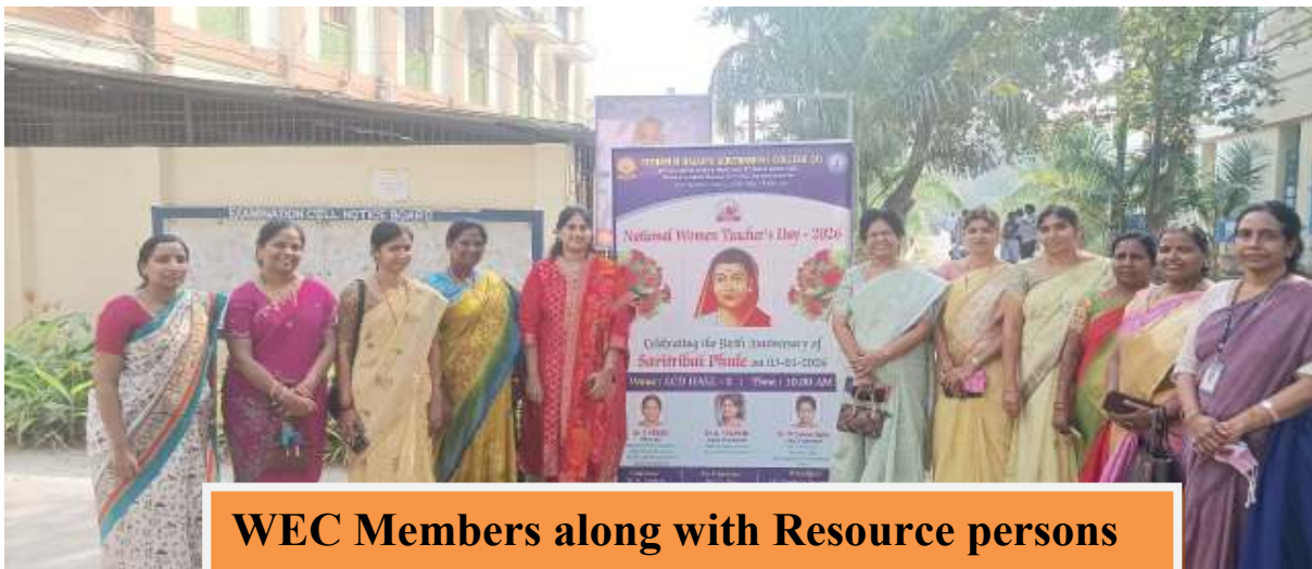
WEC Members along with Resource persons