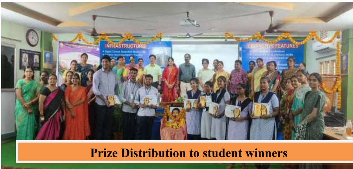
Prize Distribution to student winners